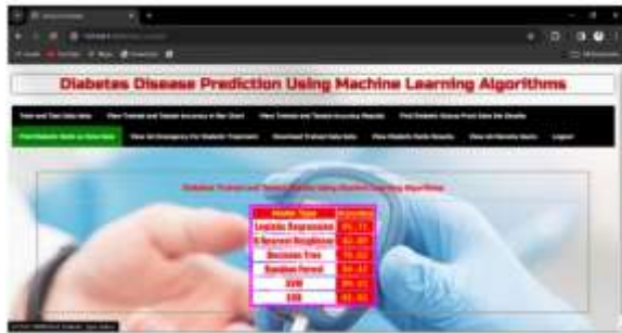
All Remote Users