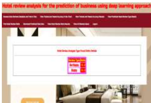
RATIO REPRESENTED IN LINE CHART :