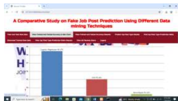
JOB POST TYPE PREDICTION RATIO RESULTS