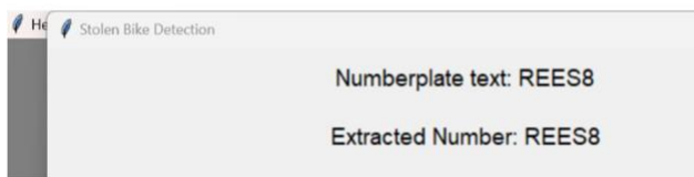
Fig. 4. Number plate extracted