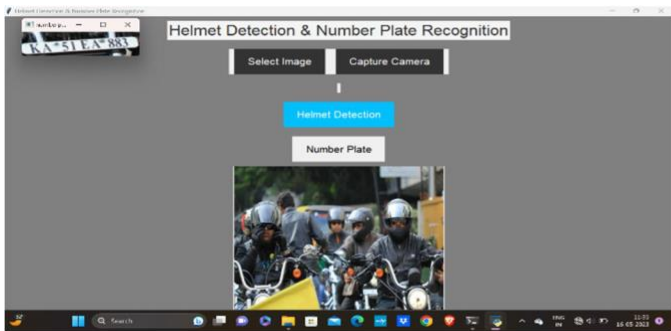
Fig. 2. Number plate extracted on test image 1 with co-ordinates