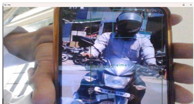
Fig. 5 Results after capturing camera input