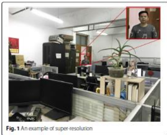
Fig. 1 An example of super-resolution

In addition, the timing issue is complicated in various transmission settings due to the large capacity [26-28]. The low-resolution (LR) raw pictures are mapped to the high-resolution (HR) equivalent using image super-resolution (SR) technology. To date, it has long-studied, but only recently popularized by the latest ultra-high-definition (3840 x 2048) televisions. Unfortunately, most videos can't be watched in UHD. To create UHD material from FHD (1920 x 1080) or lesser images, SR techniques are required [16]. Single-image SR and multiple-image SR methods categorize pictures for SR based on the number of LR images used as input. In this work, we zero in on single-image SR, which seeks to restore a high-resolution picture from a single input.