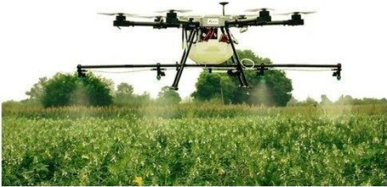
Figure 1: Pesticide spraying mechanism

This paper usually depicts the characteristics of appropriate Drones for a particular agricultural purpose. Furthermore, it will be clear as to which Drone archetype is needed for specific farming tasks. The systematic review